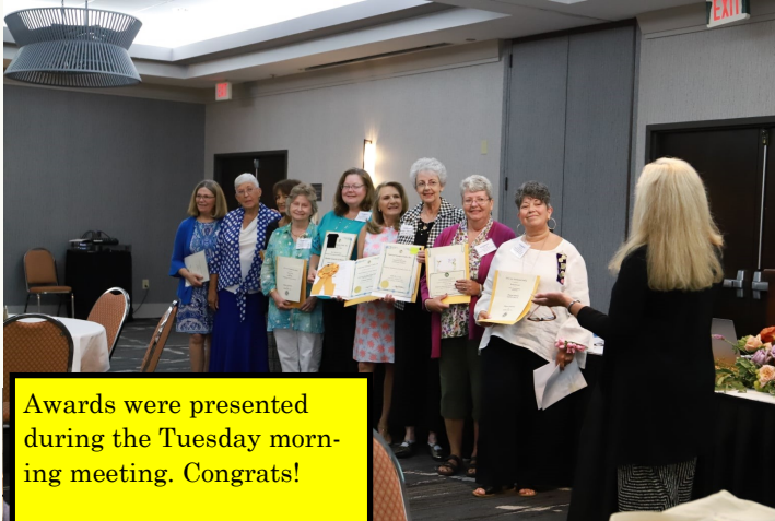
Awards were presented during the Tuesday morn- ing meeting. Congrats!