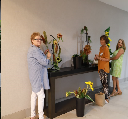
We love designing and creating...